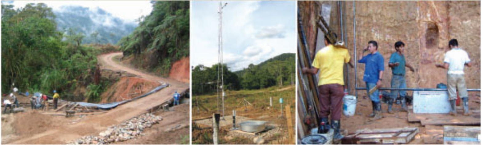
left: Construction on the Condor-Mirador road.