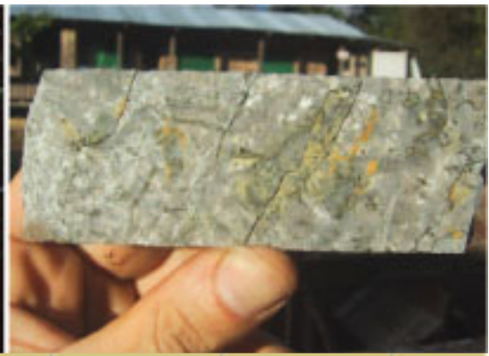
Mirador project drill core.

“Our early expectation that the Mirador ore body was a simple chalcopyrite porphyry with coarse-grained characteristics and low variability has been confirmed.