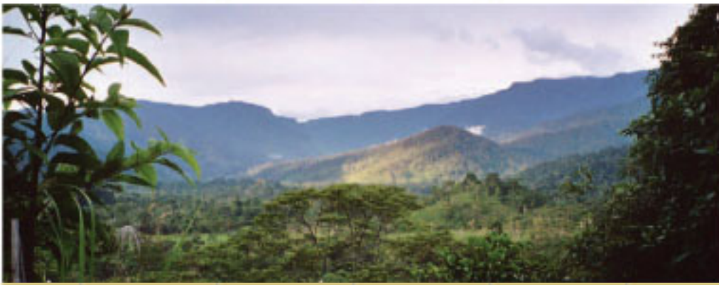
View of Mirador Norte concession from west.